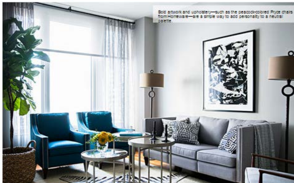
Bold artwork and upholstery—such as the peacock-colored Pryce chairs from Homeware—are a simple way to add personality to a neutral palette.