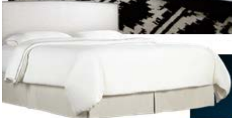
CAMERON UPHOLSTERED HEADBOARD-LINEN Homeware Buy Now