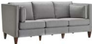
DRAKE SOFA - SILVER