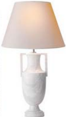
BURT TABLE LAMP Circo Lighting Buy Now