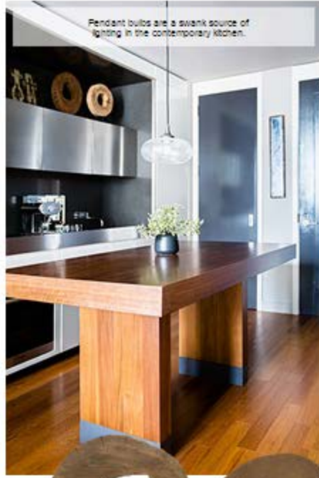
Pendant bulbs are a swank source of lighting in the contemporary kitchen.