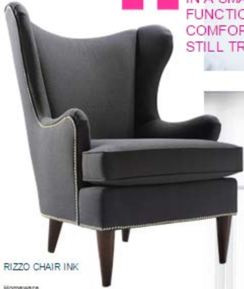
RIZZO CHAIR INK

“ IN A SMALLER SPACE, FUNCTION IS KEY BUT COMFORT AND STYLE STILL TRIUMPH. ”