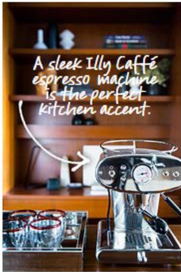
A sleek Illy Caffé espresso machine is the perfect kitchen accent.