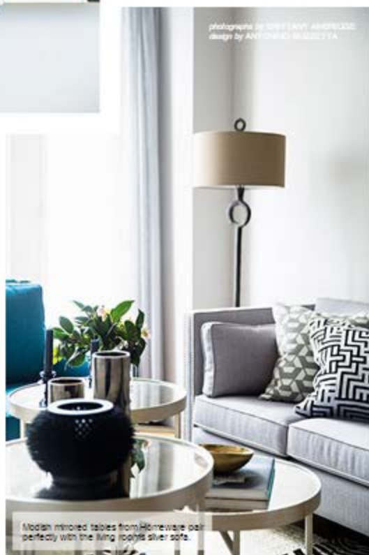
Modern mirrored tables from Homeware pair perfectly with the living room's silver sofa.