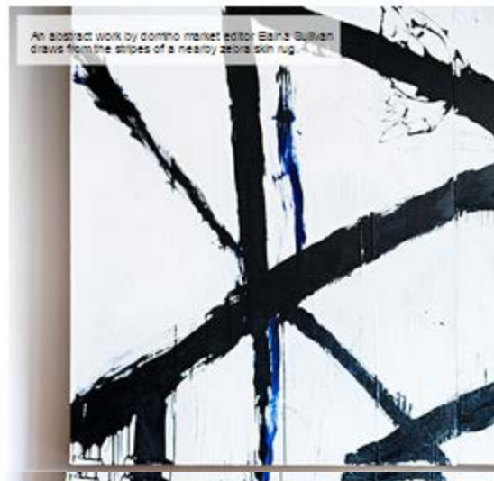
An abstract work by domino market editor Elaine Sullivan draws from the stripes of a nearby zebra skin rug.