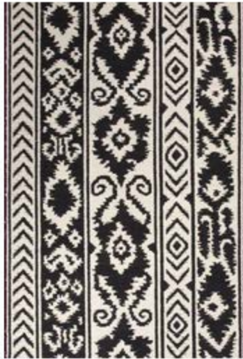
BANGALA BLACK & WHITE TRIBAL RUG - 8X10

A classic, curvy silhouette adds a touch of grandeur to the bedroom.